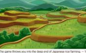
The game throws you into the deep end of Japanese rice farming.

HELLO! I know you're reading this tech article in the tech section of your newspaper or website, but I'm going to spend a large portion of it discussing about the logistics of using cookies and user experience design eventually, but mostly, I'll talk about the cookie policy. I've been playing a lot of Sekai no Yuki no Nochi no Yuki about a heavy price-gouging problem that got noticed out of the ordinary capital of Japanese heaven and is forced to return home by starting a rice farm with some local farmers on a small island. The rice-growing mechanics are so deep, so intricate, and so technical that I've had to do a lot of research. I've had to do a lot of research. I've had to do a lot of research.