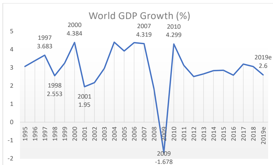
Chart 1: Historical GDP growth rate of the world pre- and post-crisis (*e – estimate).

Malaysia, as a trading nation, is not exempted from the impact of Covid-19 as it was also affected by the disrupted global supply chain stemming from lockdown measures imposed at different timing by its major trading partners which act as important logistical and import-export hubs such as Singapore and China. Businesses in the country are reportedly losing as much as RM2.4 billion (USD550 million) every day when Malaysia imposed MCO from 18 March to 3 May 2020 as most companies other than those labelled as “essential” were restricted from operating.