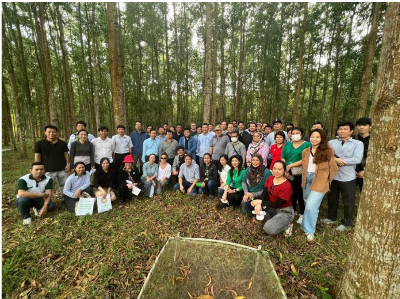
A field trip during the PEFC-For Trade Regional Conference & Field Dialogue

By the invitation of the Programme for the Endorsement of Forest Certification (PEFC) International, the Malaysian Timber Council (MTC) participated in the PEFC-For Trade Regional Conference & Field Dialogue held in Ho Chi Minh, Vietnam from 25-26 Oct 2022.